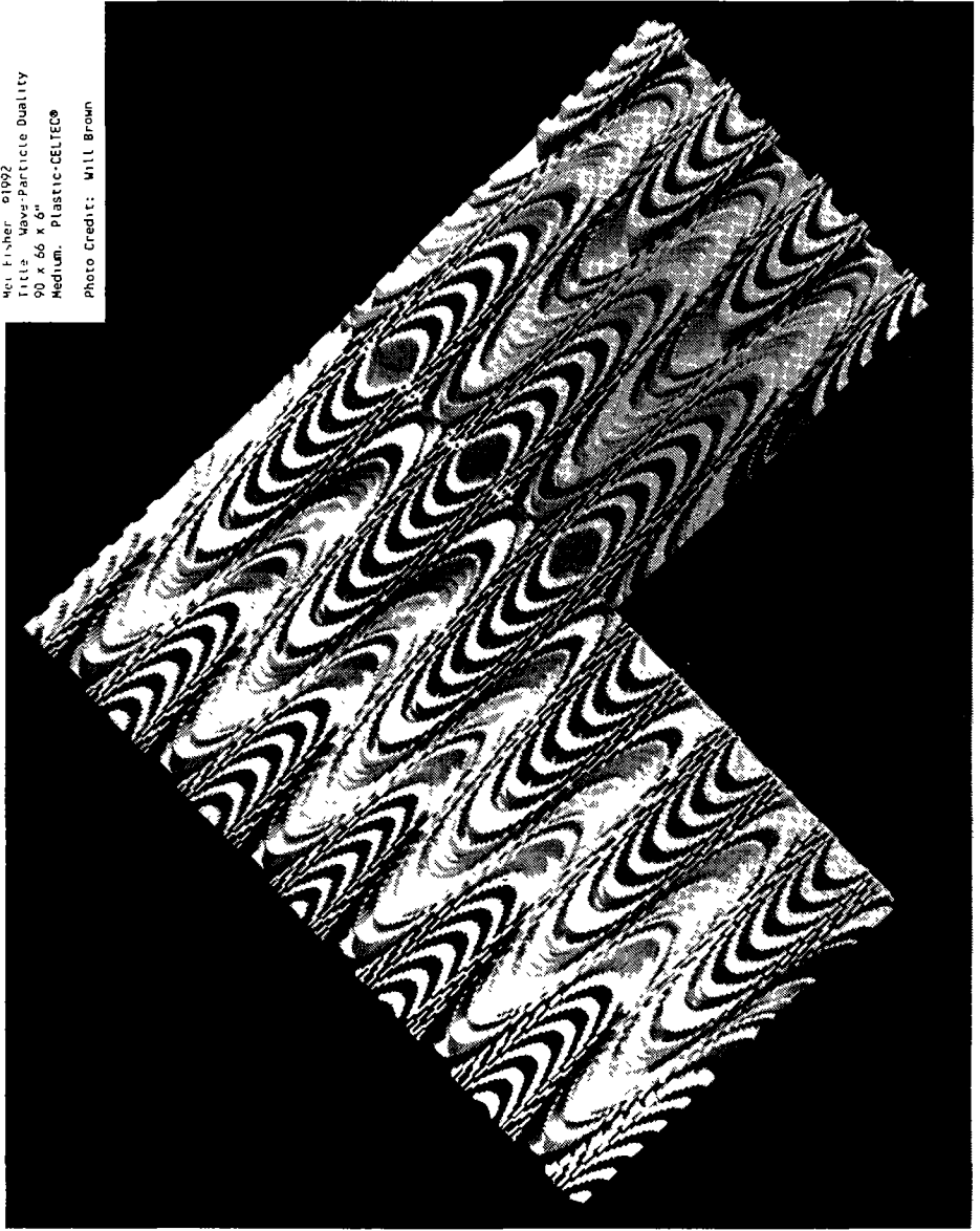
Wet Fisher 01092 Title: Wave-Particle Duality 90 x 66 x 6" Medium: PLASTIC-CELTEC®