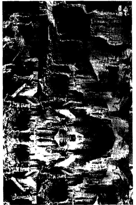
MARILYN MONROE Mixed techniques Computer. Photo Copy, Frame from film.